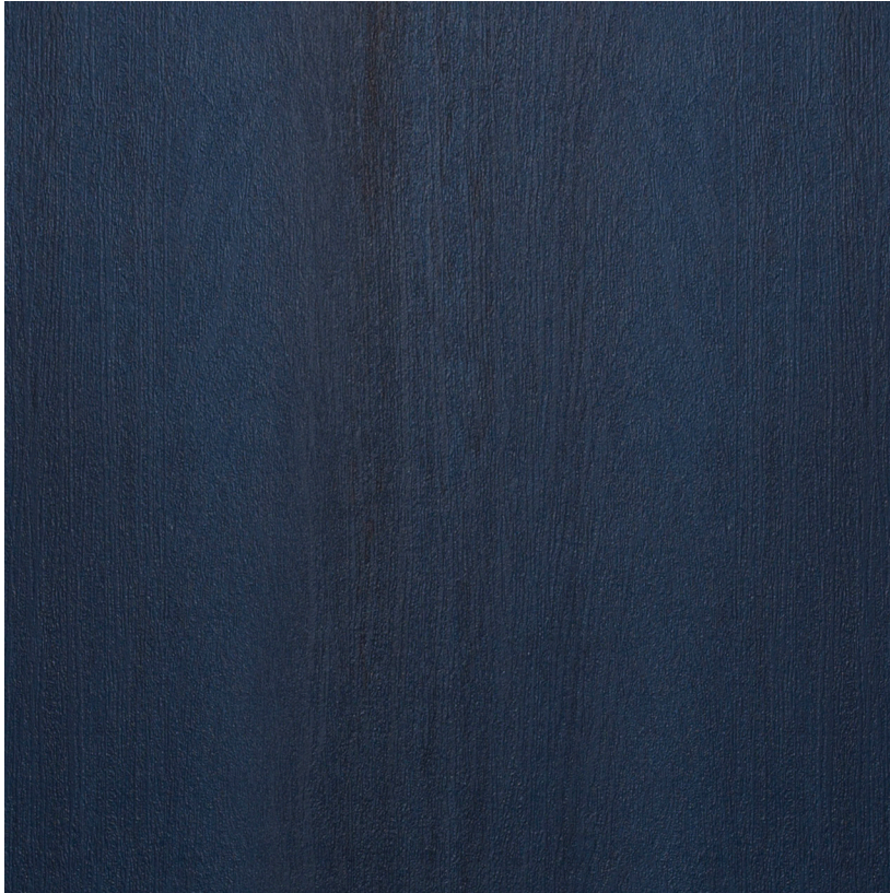
MOXIE MOTIVATE PLUS