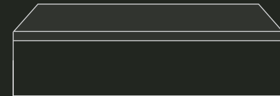
PERFORMANCE BEAST PLUS 14.5MM

12mm polyethylene turf surface layer fusion bonded to a 5mm VCR base layer.