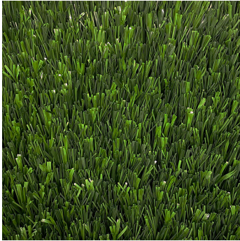
Field Green / Lime Green

Custom lines and logos are available. See BOSS Turf Lines and Logo Color Options for more details.